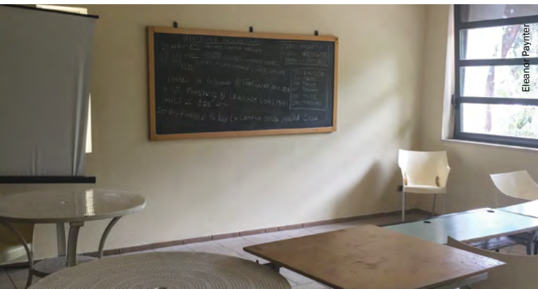
A CAS classroom, after an Italian language lesson. Italy, 2017.

By mid-2018, however, following national elections, the general sense among the CAS residents was that asylum officials were increasingly denying claims, regardless of nationality. 2 Multiple CAS residents whose applications had been rejected described feeling that these denials were also a rejection of the commitment they had made to integrating.