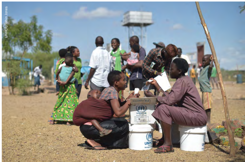
Newly arrived South Sudanese refugees being provided with non-food items, Kakuma camp, Kenya.

Lack of access to effective legal representation also affects asylum seekers' ability to launch appeals. Although they are permitted to instigate appeals to the Board without legal representation, asylum seekers who do so may lack the legal knowledge to first interpret the legal reasoning provided by the Commissioner in support of its decision. For instance, some level of legal knowledge is often required in order for an asylum seeker to decipher the meaning of refugee law concepts such as a well-founded fear of persecution or the reasonable possibility of suffering serious harm. Without this legal knowledge, it is difficult for asylum seekers to draft the points of appeal that are required to successfully instigate a review, and they may either present less effective, non-legal points of appeal, or be deterred from launching an appeal in the first place. 2 The lack of access to legal representation in Kenya therefore limits the ability of asylum seekers who wish to appeal against RSD decisions both to put forward an effective point or points of appeal, and to enable those appeals to proceed through the court process.