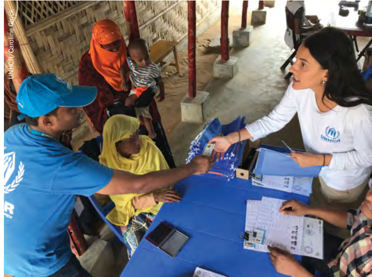
UNHCR team registers Rohingya refugees in Bangladesh.

Group recognition is a key aspect of recognising refugees, and one that is often underappreciated. For instance, Turkey – which hosts more refugees than any other country – has adopted group-based protection 5 for almost 3.7 million Syrians (although it maintains a highly