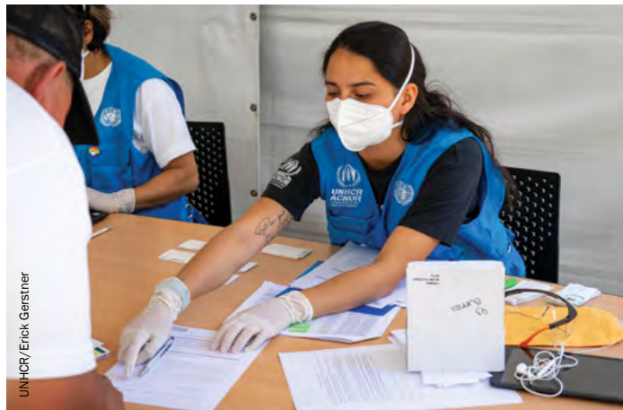
UNHCR staff explain the consent form for cash-based assistance for vulnerable asylum seekers during the COVID-19 crisis, San Jose, Costa Rica, March 2020.

For example, it is widely accepted that group ( prima facie ) recognition should only be used to recognise refugee status, whereas due