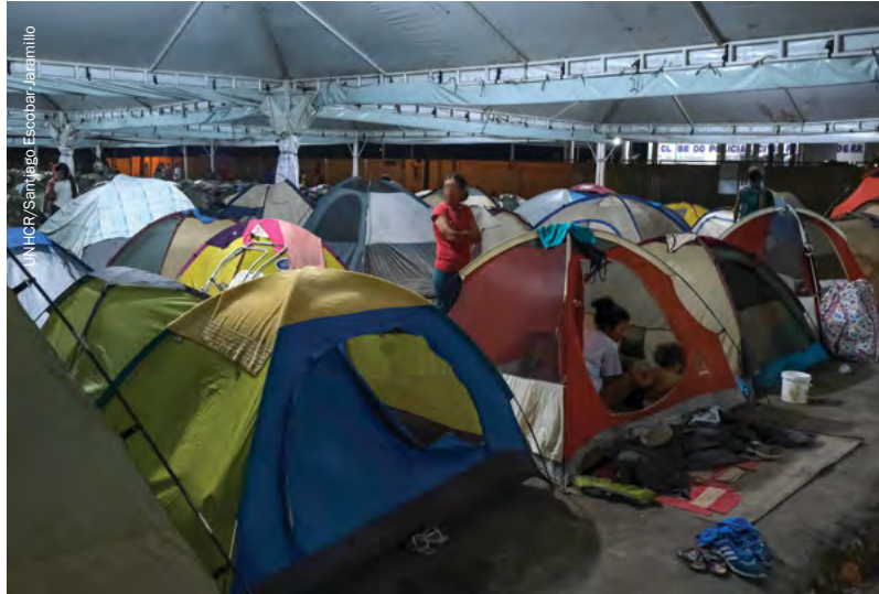
More than 1,000 Venezuelan refugees and migrants sleep in tents in Boa Vista's bus station, Brazil.

According to CONARE, 3 a business intelligence tool has been used to collect asylum seekers' fingerprints and then to map asylum claims. The technology has compared the information on Venezuelan asylum claims with over one million migratory movements, thousands of records of Venezuelans who are already resident in the country, and 350,000 claims relating to migration with the Ministry