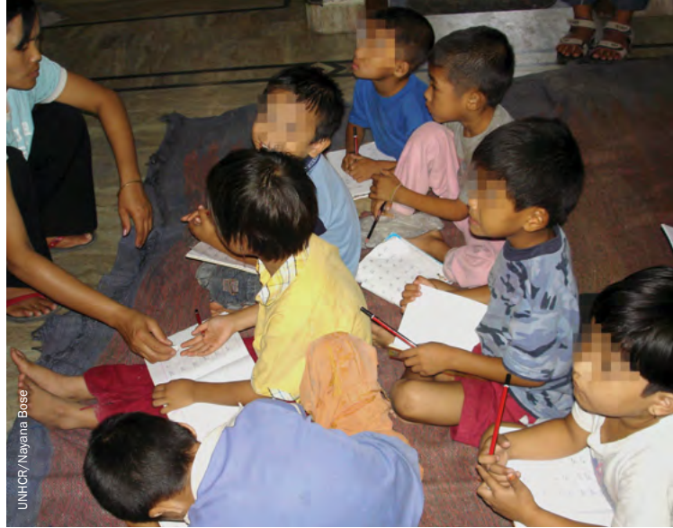
Refugee children from Myanmar learning English and Hindi at a UNHCR daycare centre, New Delhi, India. Why are their eyes pixellated? See FMR photo policy www.fmreview.org/photo-policy

to account. While it does not contain any specific provision for RSD, the GCR does explicitly mention the need to have mechanisms in place for identification and registration of refugees and for the fair and efficient determination of individual asylum claims. More concretely, it led to UNHCR